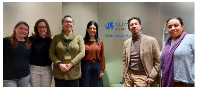
Visit photos - Activities at AJ Drexel Autism Institute.