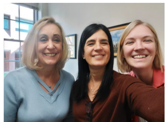
Visit photos - Activities at University of Virginia/School of Education and Human Development.