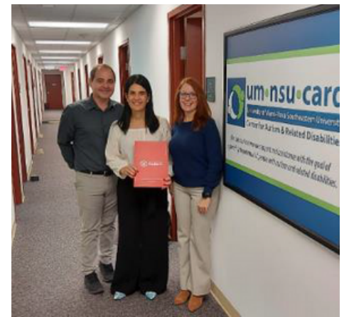
Visit photos - Activities at Center for autism & related disabilities of University of Miami