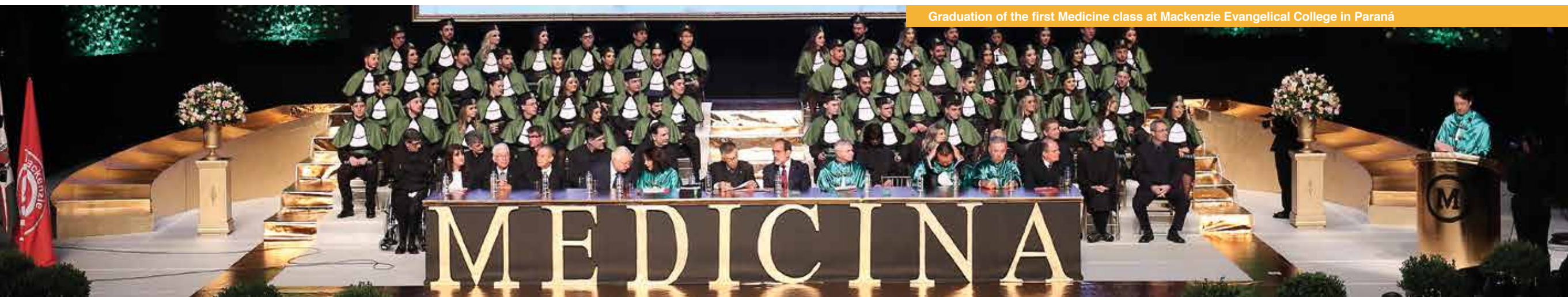
Graduation of the first Medicine class at Mackenzie Evangelical College in Paraná

Therefore, a code of ethics is, by its very nature, linked to absolutes, whereby attitudes and decisions in its field of application must be evaluated or judged and, thus, considered meritorious or worthy of disapproval.