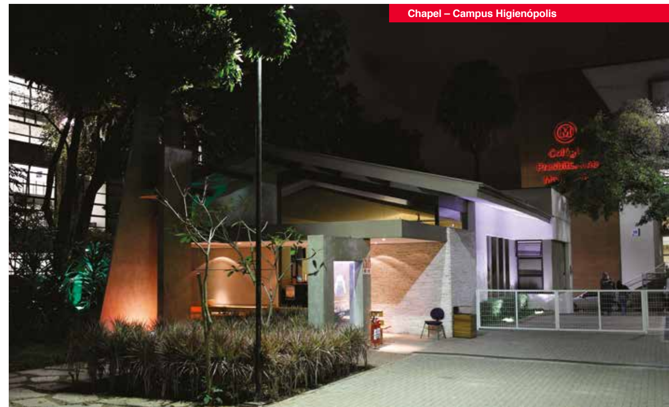
Chapel – Campus Higienópolis

In order for each employee to be clear about their own role in fulfilling this MISSION and to focus on Mackenzie’s Institutional VISION, it is essential to clarify the meaning of the expressions that make up this Code of Ethics.