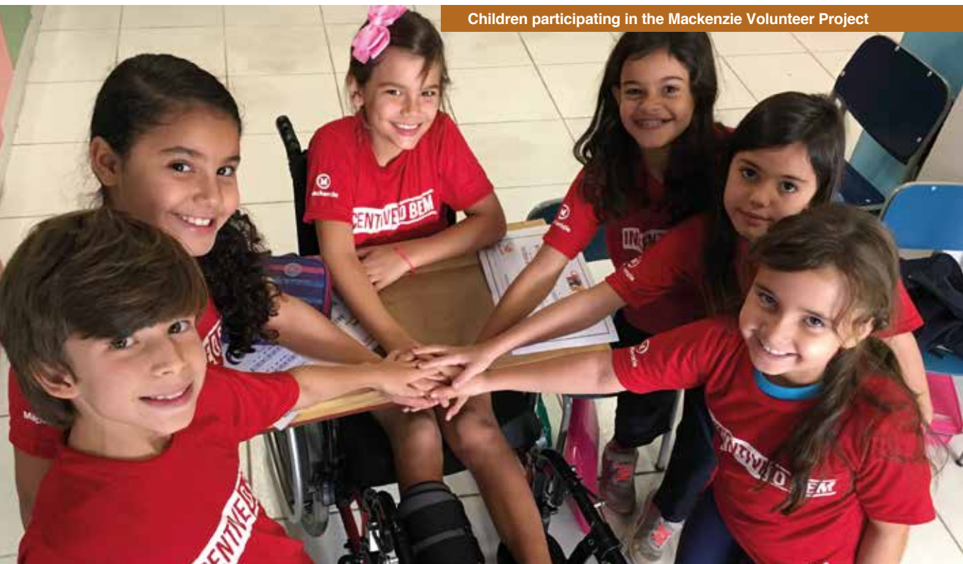
Children participating in the Mackenzie Volunteer Project