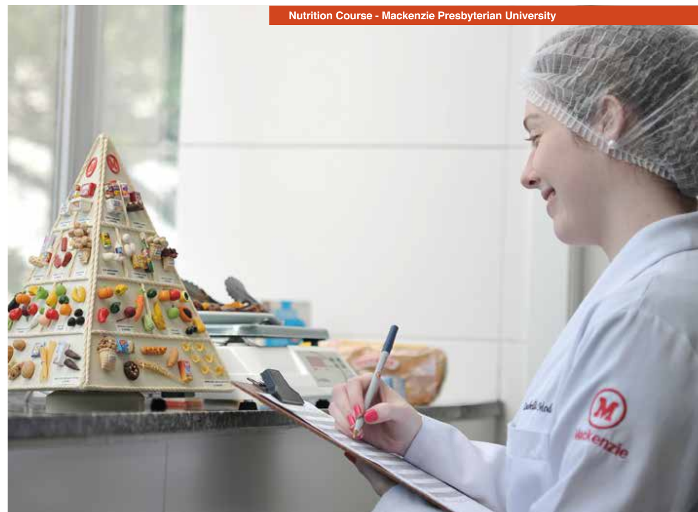
Nutrition Course - Mackenzie Presbyterian University