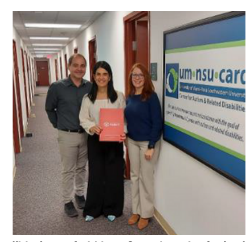
Visit photos - Activities at Center for autism & related disabilities of University of Miami