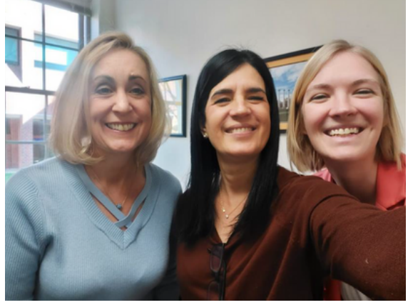
Visit photos - Activities at University of Virginia/School of Education and Human Development.